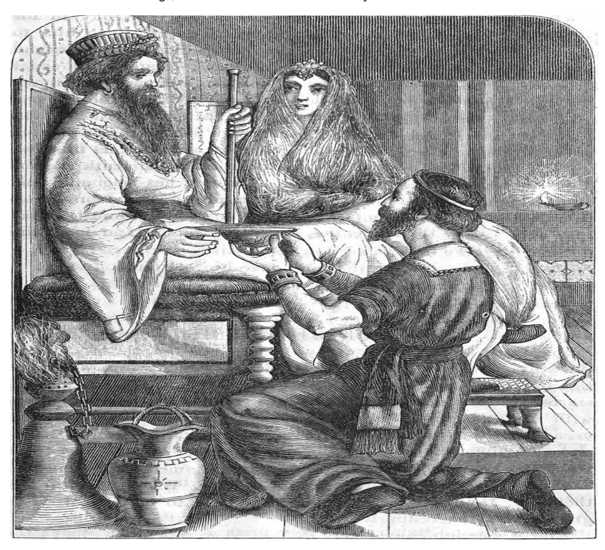
April 14, 2024

Sharing God's love with those around us and our lives with one another. Preparing for today, tomorrow and eternity. Caring for each other, our community, and the world.